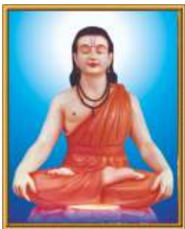
Philosopher Saint Shri Dnyaneshwara

It may be also noted that if science is not utilized for the well-being of the mankind, but for purposes like building atomic bombs or other weapons, it can cause complete devastation and destruction of the world.